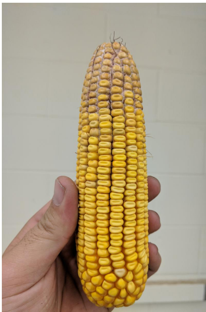
Fig 1. Gibberella ear rot developing from the tip down

It is not always possible to tell which fields were planted with GER susceptible hybrids, because this information is not readily available in all seed catalogs. However, it should be noted that no hybrid is 100% resistant or immune to GER. As a result, all fields that have not been harvested and have been exposed to rain over the last several days are at risk for Gibberella and other ear rots (including Trichoderma ) and grain contamination with mycotoxins. Peel back the husk and examine about 10 ears in each of 8 to 10 sections (approximately 50-ft-long stretches of rows) spread out across the field for symptoms of GER either at the tip or at the base of the ear (see pictures). This will give you an idea of whether your field is affected by GER and vomitoxin will likely be a concern. Where possible, handle and store grain from severely affected fields separately from grain harvested from healthier fields (fields harvested before the rains with little or no GER).