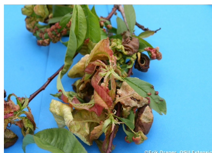
Peach foliage severely affected by Taphrina deformans , a fungal disease NOTE: Fuzzy white spores forming on leaves