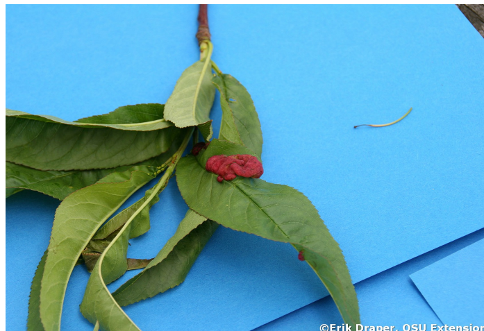
Peach Leaf Curl, Taphrina deformans , a fungal disease on peach foliage

If PLC disease was a problem this past year, now is the time to do something to correct that issue. Get out there NOW and straighten the curls out of your future peach and nectarine leaves!