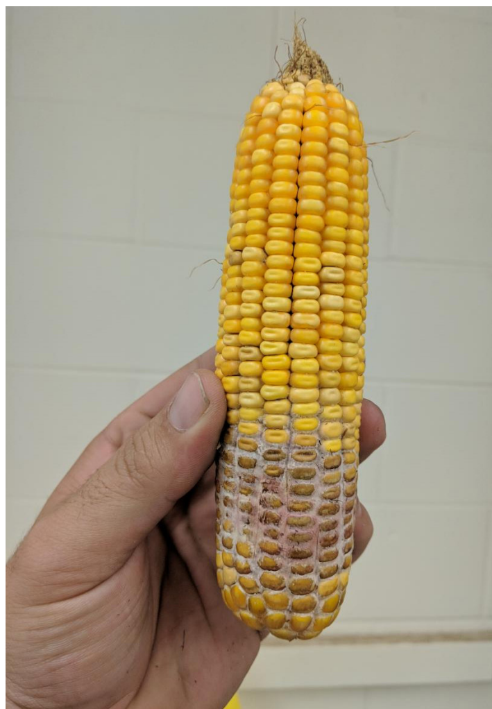
Fig 2. Gibberella ear rot developing from the base up