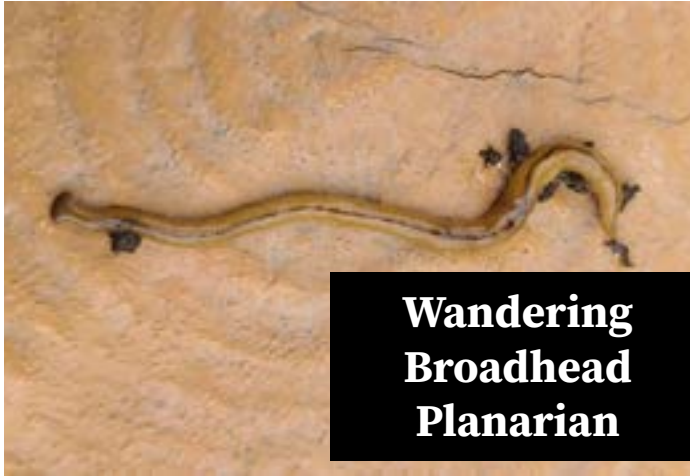
Wandering Broadhead Planarian